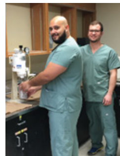
STUDENTS WORKING ON THE CLINIC FLOOR

"Upon graduation I will be moving to rural Alberta where I plan to establish my career while giving back and contributing to my community. I look forward to spending more time with my family and pursuing my goals."